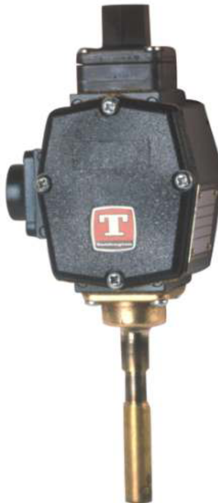
Model shown DBG/AM

The thermostat system comprises a bellow integral with a rigid extension tube and sensing phial for direct mounting. To achieve correct thermal